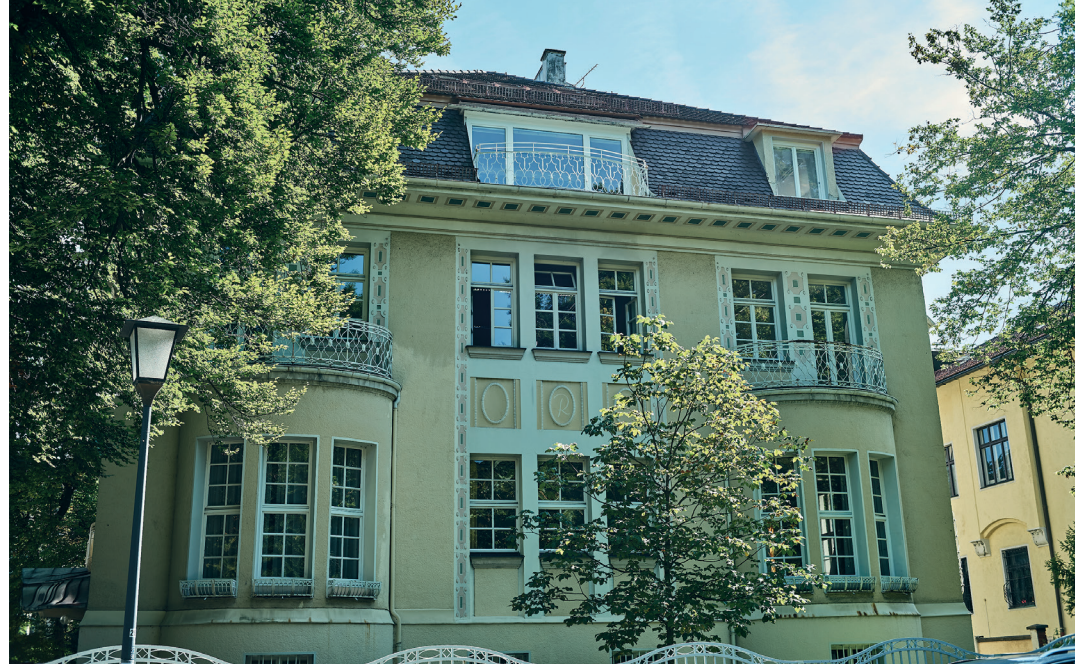
Käte Hamburger Research Centre

At global dis:connect fellows find ideal conditions for the further development and completion of their projects. During their six- to twelve-months stay, fellows are expected to reside in Munich and to participate in the events of the centre, such as the regular lunchtime colloquia and the interdisciplinary reading group. Fellows are encouraged to communicate their research results on one of the centre's publication platforms. During their stay fellows are given the opportunity either to organise an international workshop in tandem with one or more other fellows on a research topic or to organise events in cooperation with our partner institutions in the city of Munich.